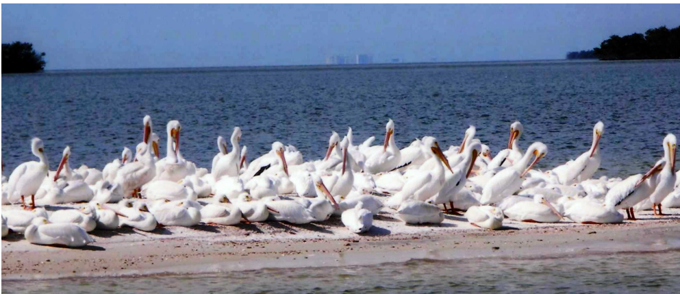
White pelicans resting on a sandbank

While touring the park we met several German families who really struggled with the high humidity and the mosquitoes .We highly recommend going in the winter months. If you are adventurous, you can try eating alligator or snake meats in Everglades City. "Guten Appetit"