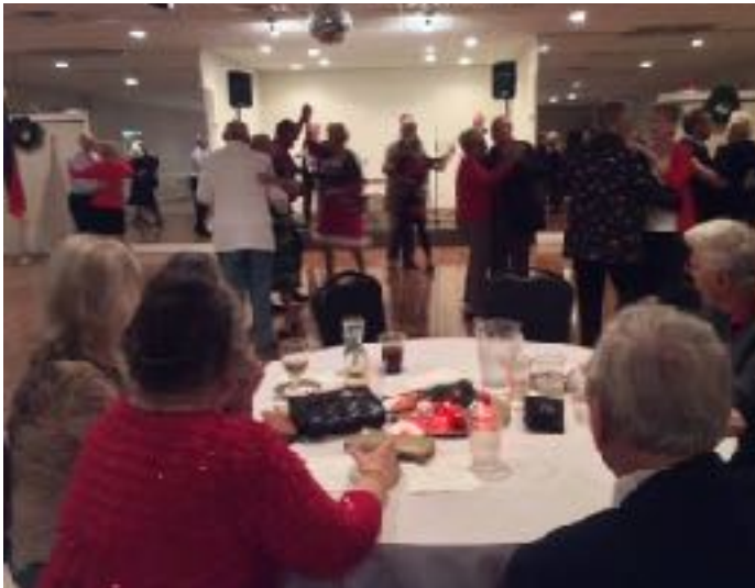
Enjoying the music and dancing