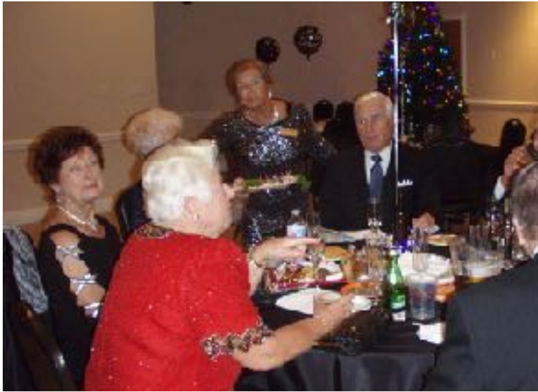
New Years Eve gemuetlichkiet

Although we had a low attendance, everyone had a good time and we enjoyed the champagne